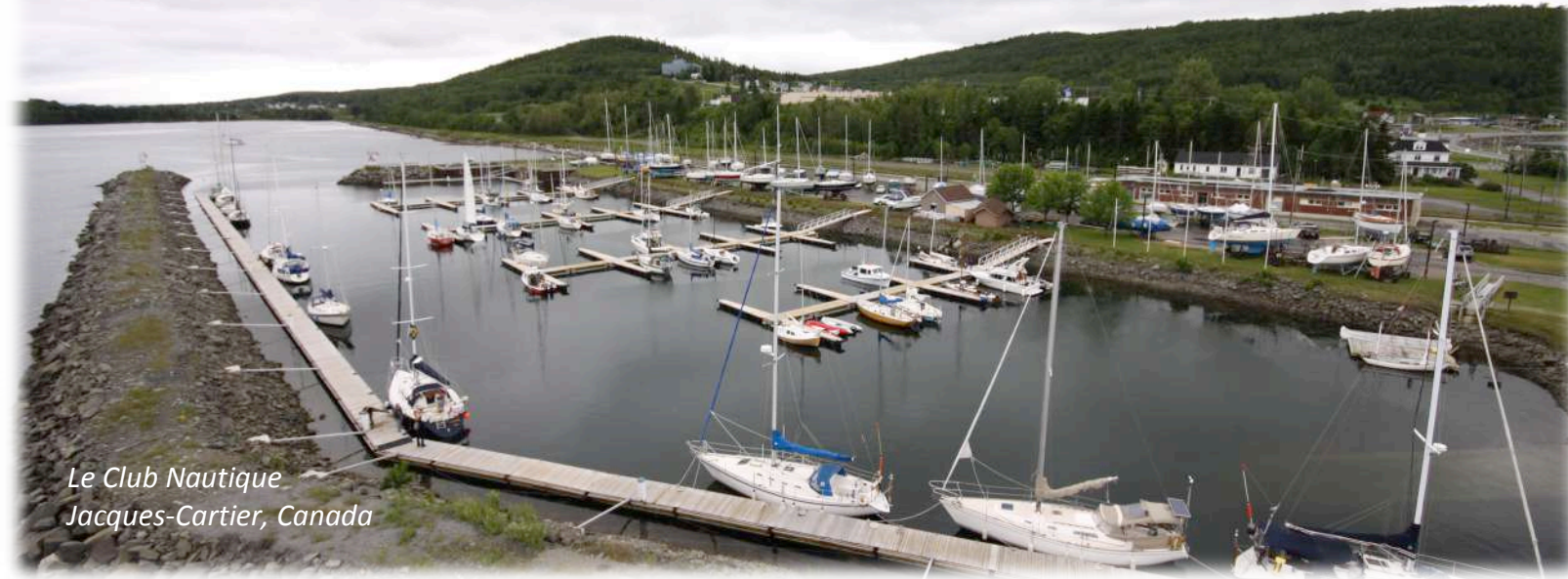
Le Club Nautique Jacques-Cartier, Canada