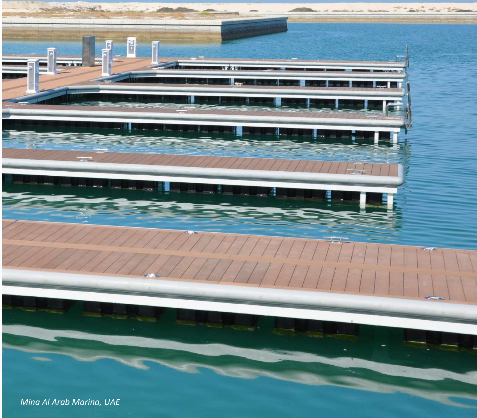
Mina Al Arab Marina, UAE