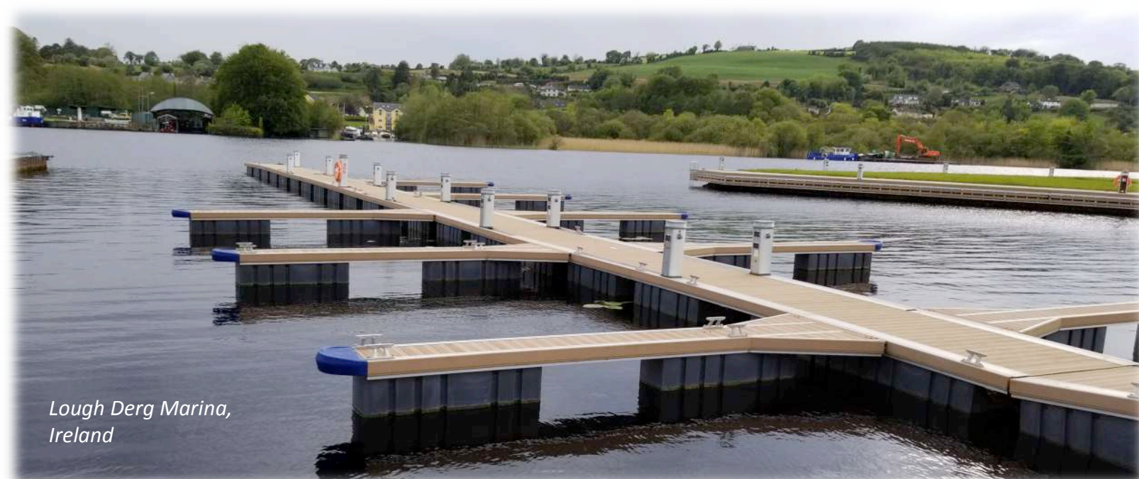
Lough Derg Marina, Ireland